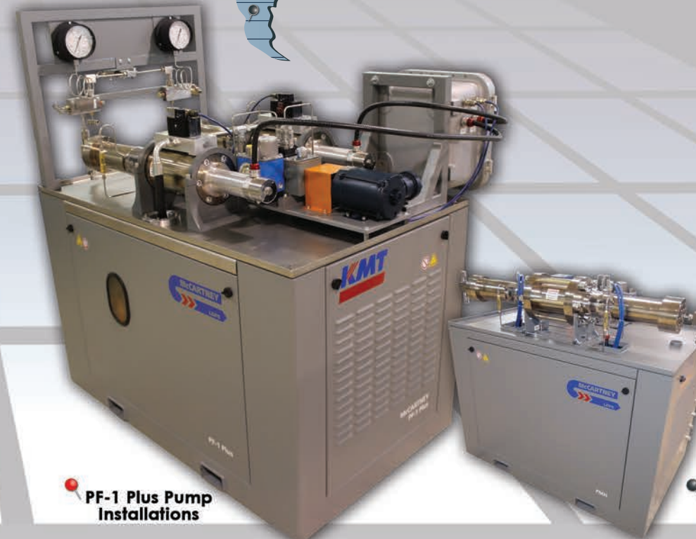
PF-1 Plus Pump Installations